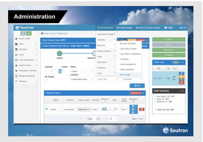
Administration pages for archive staff

The Archivist / Records Manager is in control of every aspect of the system through the use of simple menu selections. There are no external files to manage and no settings to be maintained on individual PCs. Soutron has easy to configure fields, data structures, record templates, classifications, thesaurus terms, locations and policies. Multiple Search Portals can be set up with secured content delivered as needed.