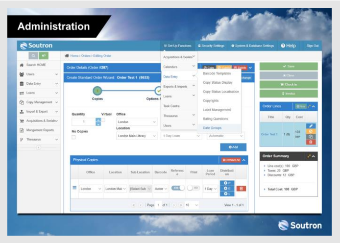
Administration pages for library staff